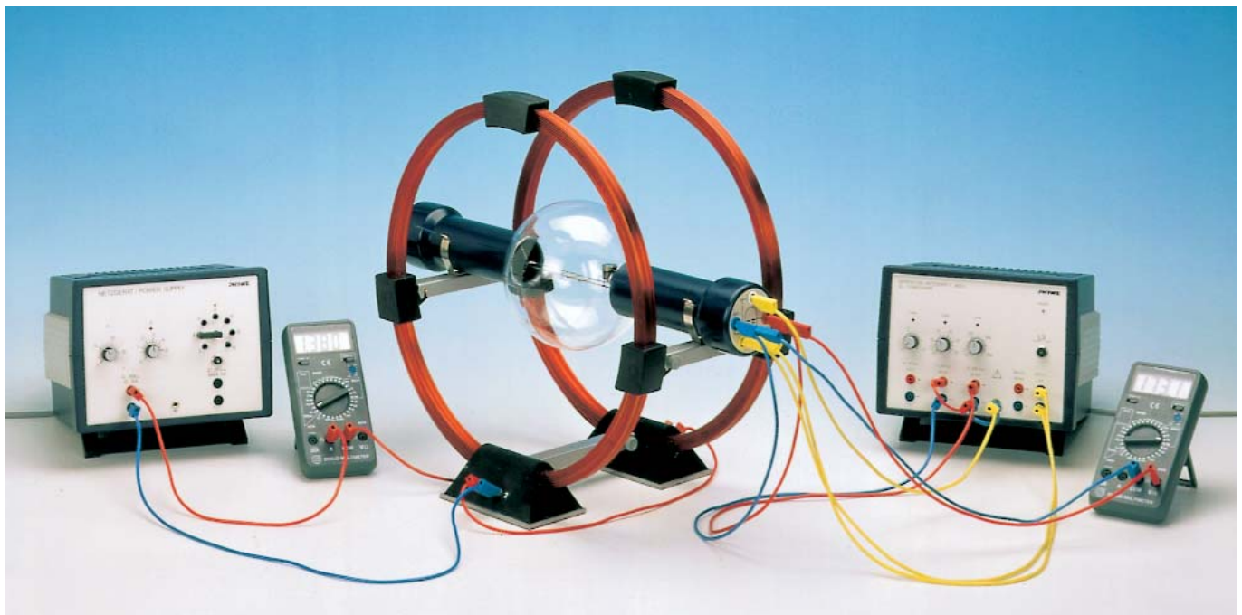
Fig.1: Experimental set-up for determining the specific charge of the electron.

If the magnetic field is uniform, as it is in the Helmholtz arrangement the electron therefore follows a spiral path along the magnetic lines of force, which becomes a circle of radius r if \vec{v} is perpendicular to \vec{B} .